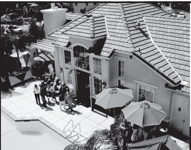
Bella Vista Clubhouse & Pool

Fran Drescher, shown at her Malibu home with Esther, says her Pomeranian has "taught me about loving."